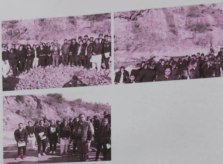
Subject tour by the 2 nd sem students on 20 th of Jan., 2020 at Ramnagar